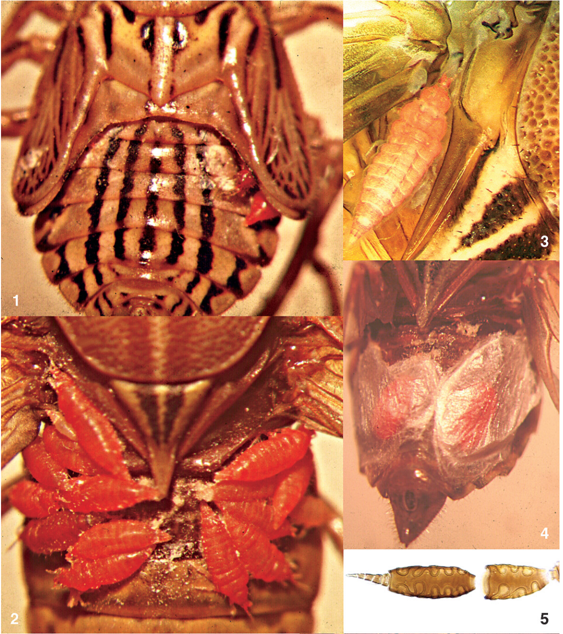
Figs. 1-6. Aulacothrips dictyotus (Heterothripidae) and Aethalion reticulatum (Homoptera). 1. Aethalion nymph with Aulacothrips larvae under wing bud. 2. Aulacothrips larvae on abdomen of Aethalion . 3. Aulacothrips larva under Aethalion hindwing. 4. Aulacothrips pupal cases on Aethalion tergites. 5. Aulacothrips antenna. 6. Aulacothrips tergites VII-VIII.