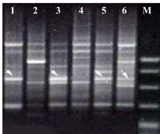
Figure 2. Female-linked molecular polymorphism in Ae. intermedius . Gel electrophoresis after PCR amplification with the primer of OP-A-08. M (Mw): 1031, 900, 800, 700, 600, 500, 400, 300, 200, 100, and 80 bp in length. Lanes 1, 3, 5-6: females and larvae; Lanes 2 and 4: males. Arrows indicate the female-linked fragments.

In populations at both Valkó and Nagykovácsi, a polymorphic PCR-fragment at about 800 bp appeared in females (N° 1, 3, 5) and larvae (N° 6), but not in males (N° 2 and 4) (Fig. 2). Obviously, the sample of larvae N° 6 was a mixed pool of both sexes. The final experiments whether this fragment can be considered as a sex-linked marker is under progress.