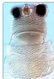
Head & pronotum

Female macropterous. Head wider than long; strongly reticulate, not projecting in front of eyes, ocellar region elevated as pronounced cylinder; occipital ridge absent, cheeks not constricted; two pairs of postocular setae; maxillary palps 2-segmented. Antennae 8-segmented, segment I without paired dorso-apical setae; III with sense cone forked, IV with one forked and one simple sense cone. Pronotum strongly reticulate, no long setae. Mesonotum entire, reticulate, with anteromedian campaniform sensilla. Metanotum strongly reticulate with triangle, median setae behind anterior margin; campaniform sensilla close to posterior margin. Fore wing with anterior fringe cilia longer than costa setae; first vein with wide gap in setal row, two setae distally; second vein with two setae. clavus with four veinal but no discal setae; posteromarginal fringe cilia wavy. Prosternal basantra membranous, without setae; mesosternal endofurca without spinula; metasternal endofurca transverse and without spinula. Legs without strong reticulation, tarsi 1-segmented. Abdominal tergites without ctenidia, with entire craspedum; tergite II without special sculpture; III–VIII with reticulation laterally, VIII posterior margin with comb laterally; IX with two pairs of campaniform sensilla; X without median split. Sternites with entire craspedum on posterior margin, II–VII with three pairs of posteromarginal setae. Male darker than female, sternites with pore plate.