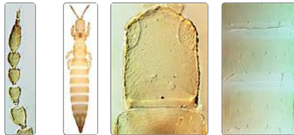
styliifer antenna styliifer female styliifer head styliifer _sternites V-VII