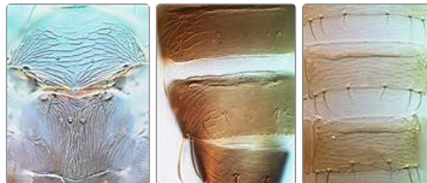
setae meso & metanota