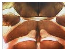
Neohydatothrips magnoliae metasternum