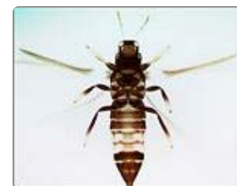
Neohydatothrips magnoliae female