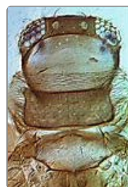
Neohydatothrips flavicingulus _head & pronotum