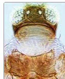
Neohydatothrips samayunkur head & pronotum