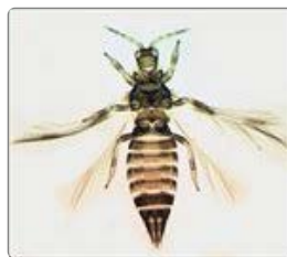
Neohydatothrips samayunkur female