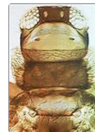
Neohydatothrips magnoliae head and pronotum