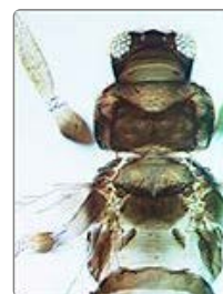
Neohydatothrips gracilicornis head and thorax