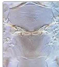
perplexus meso & metanota