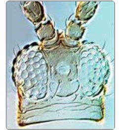
formosus male tergites VIII-IX formosus male sternites fragilis head